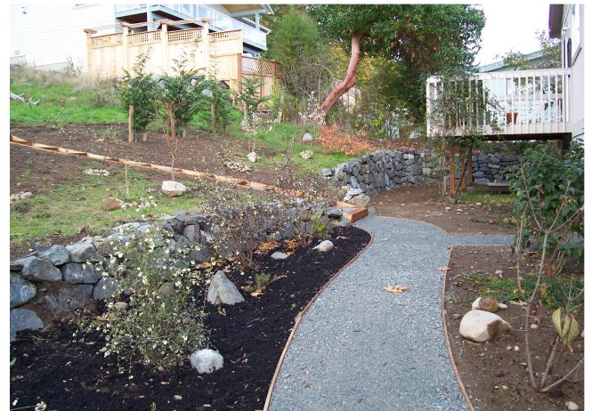
Photo: Amended soil(left) and non-amended soil(right) along a walkway.

For better grass and less summer watering, add a layer of compost to your lawn (1/4 inch) and planted areas (1 - 2 inches). This will help your soil absorb and hold rainfall, leading to a healthier lawn and plantings, and reduce your water bill and need for fertilizers. Do this annually in the late spring/early summer (May) or as needed.