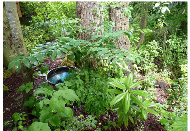
Photo: Layered plants in a natural setting help collect rainwater and protect soil from erosion. Courtesy of Innovative Landscape Technology.

'Layering' your landscape means you put the tallest plants in the back of your planted area, the shortest in the front, and mix other heights in between. Besides creating interest in your garden, this provides great habitat for wildlife, and also catches rain drops so they don't become runoff. The extra shade also helps your soil hold moisture during our dry summers.